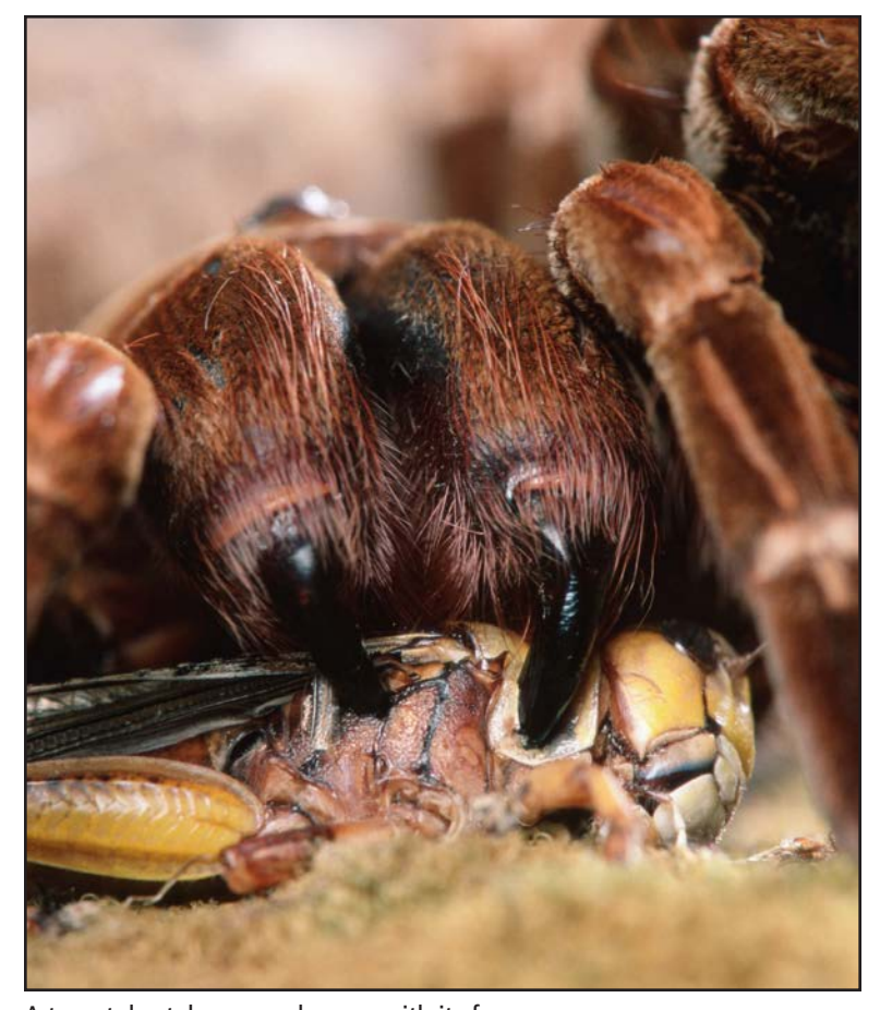
A tarantula stabs a grasshopper with its fangs.

To catch prey , a tarantula sits very still and waits. When an animal comes near, the tarantula jumps and jabs its fangs into it. Venom shoots into the animal and makes it stop moving.