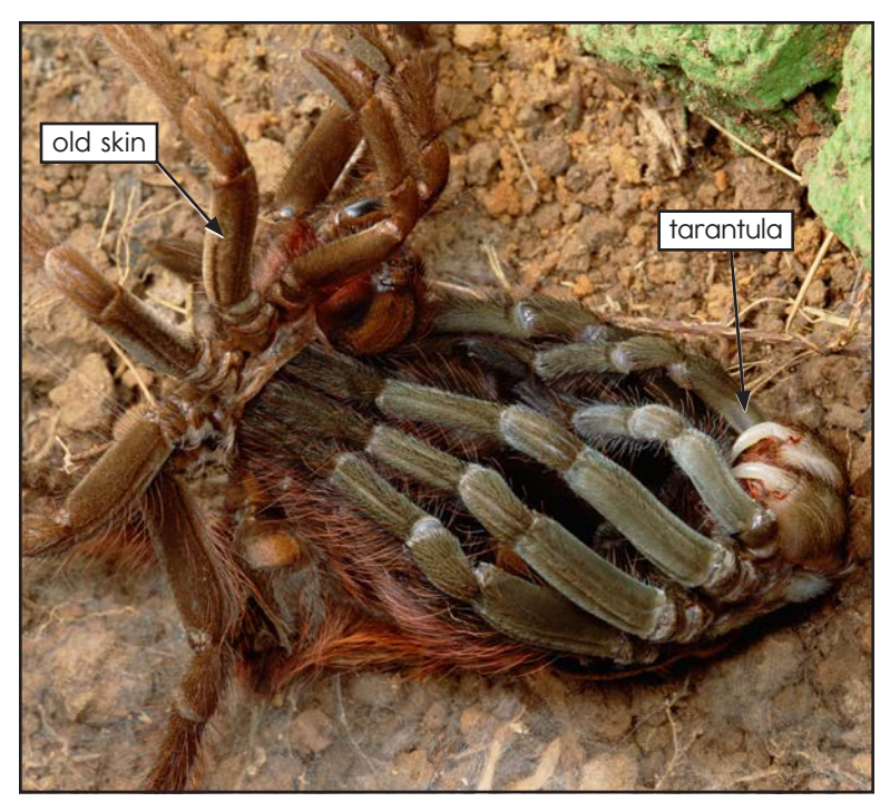
This Ecuadorian brown velvet tarantula is molting , or pushing out of its old skin.

Some tarantulas are black or brown, but many others are colorful. They may be red, orange, yellow, pink, blue, purple, or other colors. Some have colorful stripes or other markings on their legs or bodies.