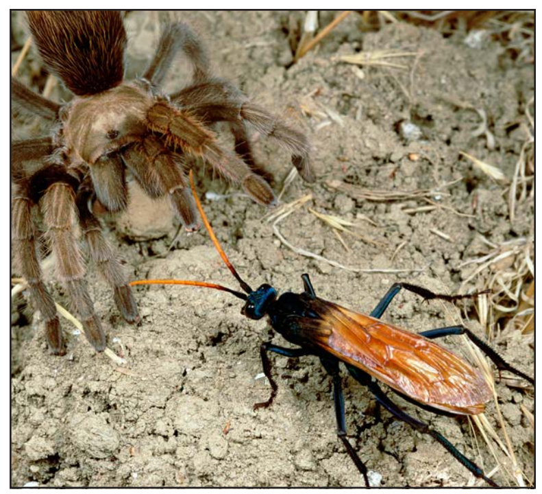
A tarantula hawk gets ready to attack a tarantula.

You might think tarantulas are too big to be hunted. Not true! The tarantula hawk—a big wasp—hunts tarantulas as food for its young. A female wasp stings a tarantula, which then stops moving. The wasp lays one egg on the tarantula's body. When the young insect comes out, it feeds on the tarantula.