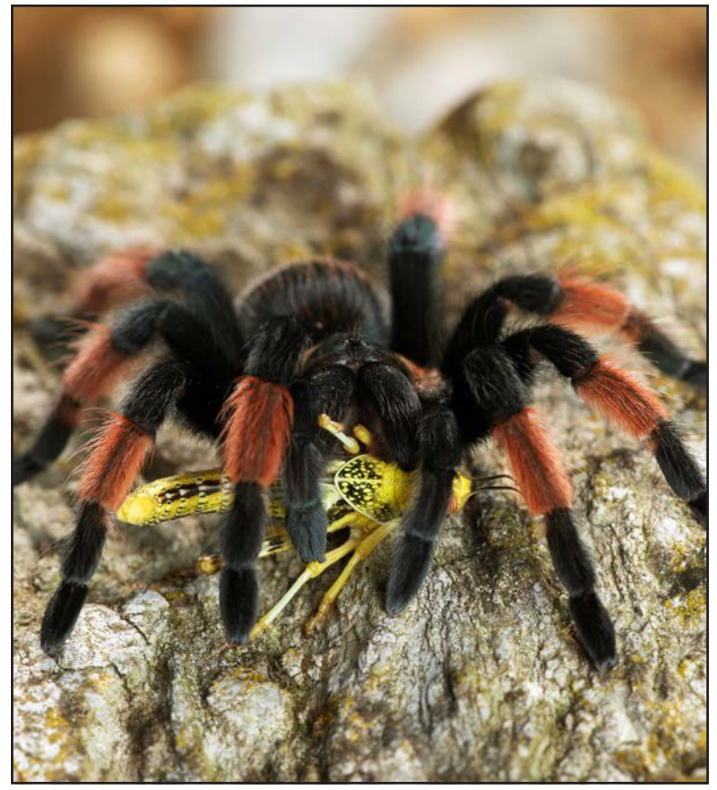
A grasshopper is a delicious meal for a Mexican red-leg tarantula.